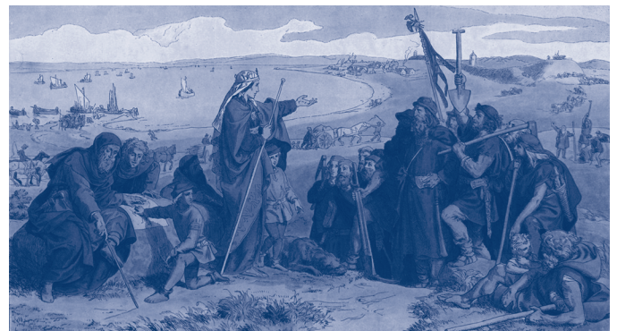
Thyra Dannebod ordering the building of the Danevirke by Lorenz Frølich.

Legend has it that 9th century Queen Thyra Dannebod was instrumental in expanding the Danevirke ("work of the Danes"), a rampart protecting the Danish kingdom's southern border from foreigners. We know Queen Thyra's name (and importance) because she is the most mentioned woman on Denmark's runestones. In fact, the oldest and best known rune stones in Denmark, the Jellingstones, both mention Queen Thyra by name. The smaller of the Jellingstones was erected in her honor by her husband, the first recognized King of Denmark, Gorm the Old; it refers to Queen Thyra as "Danmarkar bót," anglicized as "Dannebod," or "Danebod" which translates as "Denmark's adornment," "strength," "salvation" or "remedy."