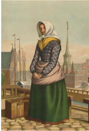
Young Girl, Skovsboved- F.C. Lund Lithograph -Duplicate (En Skovsbovedpige)

When you visit the DAC online Collections site, there is a brief description of each item. Here are two more examples: