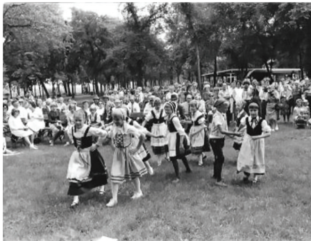
Photo from Danish Day 1966

Start by logging in to the DAC website, scroll down and click "Collections". Then scroll down and click mncollections.org where you will see everything we have catalogued so far. Once again, we appreciate your feedback and hope you enjoy viewing the collection.